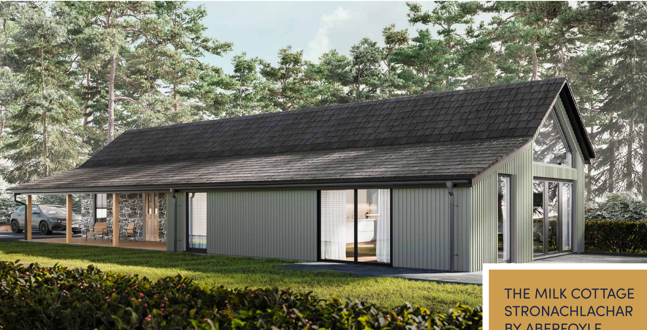
THE MILK COTTAGE STRONACHLACHAR BY ABERFOYLE FK8 3TX